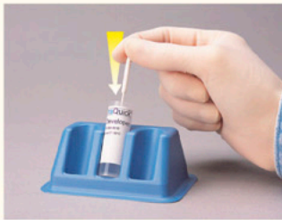
Put the loop (with blood) into the test kit