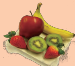
Serve fruit as a healthy snack

Preschool children need 3 regular meals and 2 snacks a day. They enjoy eating with their parents. It is important for you to serve as a good model for your child by eating a balanced diet with a variety of vegetables and fruits. This helps your child develop healthy eating habits in early stage.